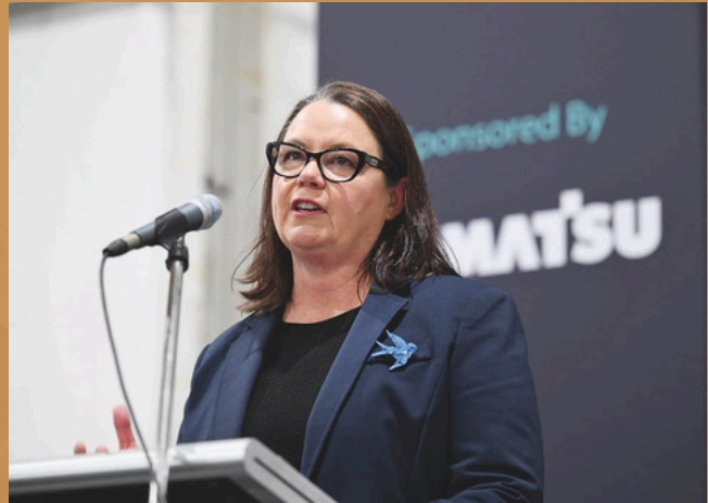
Federal Resources Minister Madeleine King speaking at QME 2024.